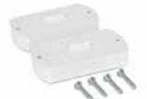
Fits all inlets. #519