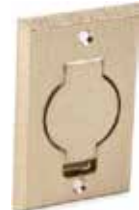
Satin Brass #651BMS